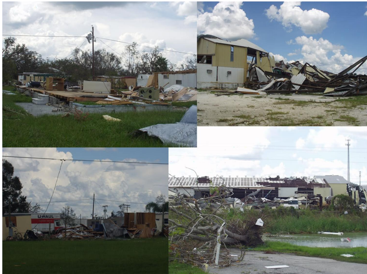
Figure 6. Damage photographs from Hurricane Charley.

Acknowledgments: The Los Angeles Times. Los Angeles, CA: Aug 15, 2004. "Aftermath of a Hurricane."