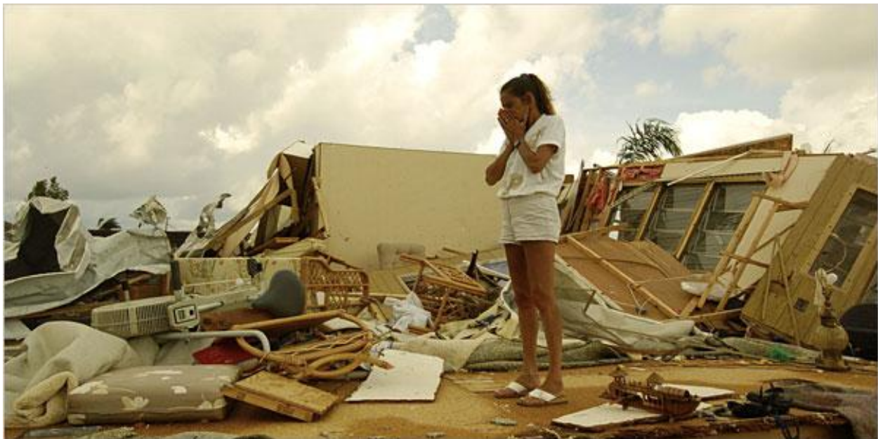
Figure 1. Woman overlooks her damaged home.