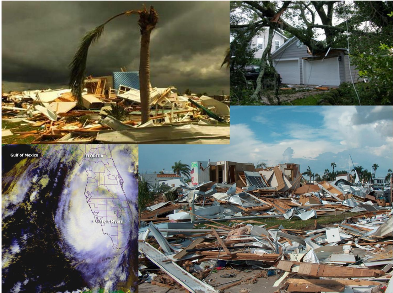
Figure 3. Damage from Hurricane Charley and satellite image of Hurricane Charley's landfall.