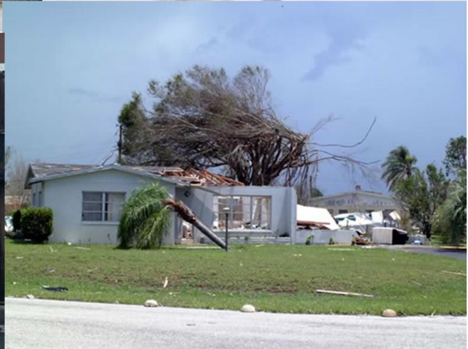
Figure 4. Damage from Hurricane Charley.