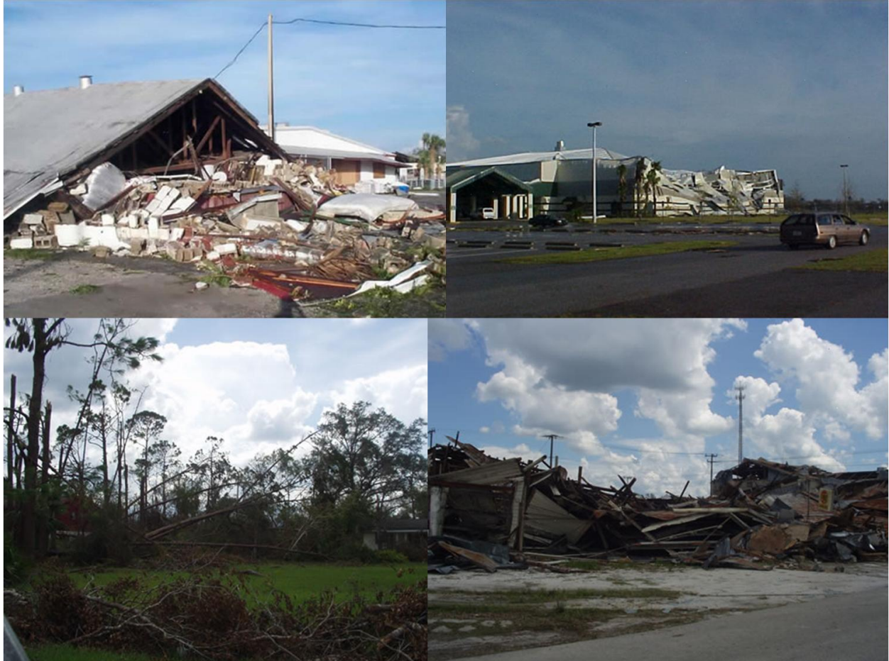
Figure 5. Damage to buildings and uprooted trees from Hurricane Charley.