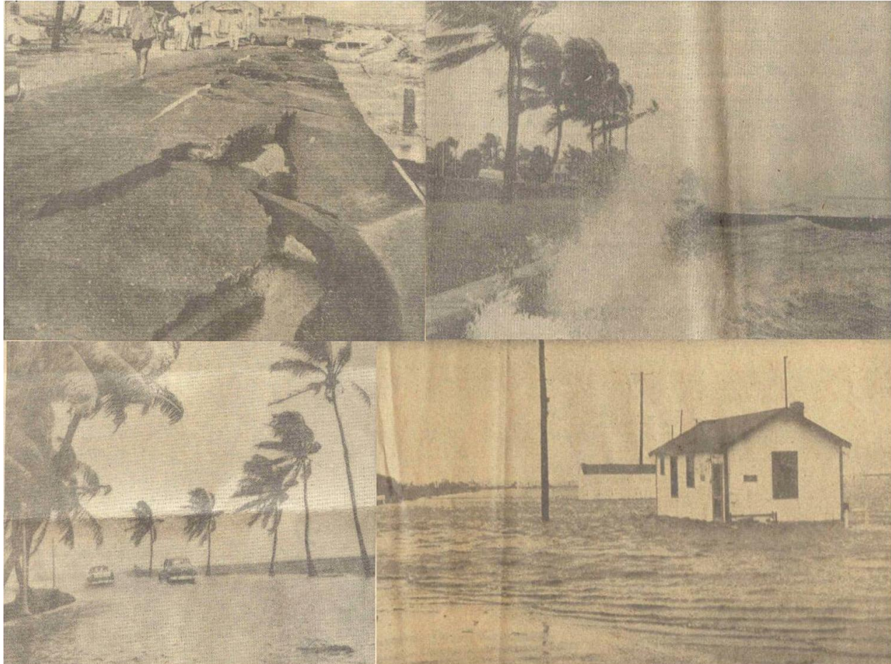
Figure 5. Pictures from www.hurricanes-blizzards-noreasters.com .

Links for more information: http://www.hurricanes-blizzards-noreasters.com/hurricanedonna.html , http://www.sun-sentinel.com/news/local/southflorida/sfl-1960-hurricane.0,4024486.story , http://www.nhc.noaa.gov/HAW2/english/history.shtml#donna , http://www.nhc.noaa.gov/archive/storm_wallets/atlantic/atl1960/donna/ , http://www.aoml.noaa.gov/general/lib/lib1/nhclib/mwreviews/1960.pdf , http://www.naplesnews.com/news/2008/sep/09/remembering-donna/ .