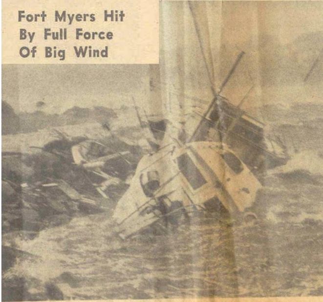
HURRICANE DONNA WASHED several fishing craft up on land in cove in rear of Sea Horse restaurant on the Grotto Long Point Rd., Noank. The picture was taken at the height of the storm Monday.