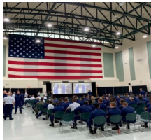
NWS TBW Participates in U.S. Coast Guard 2022 Safety Stand