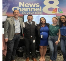
NWS Tampa Bay visit to WFLA