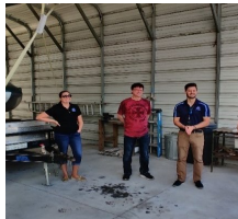
NWS Tampa Bay Meteorologists Interact with Florida Forest