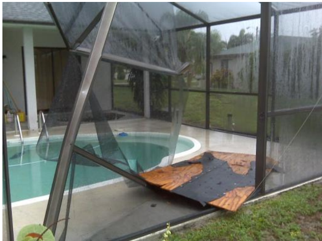
Roof sheathing from a nearby home was thrown into this pool cage.