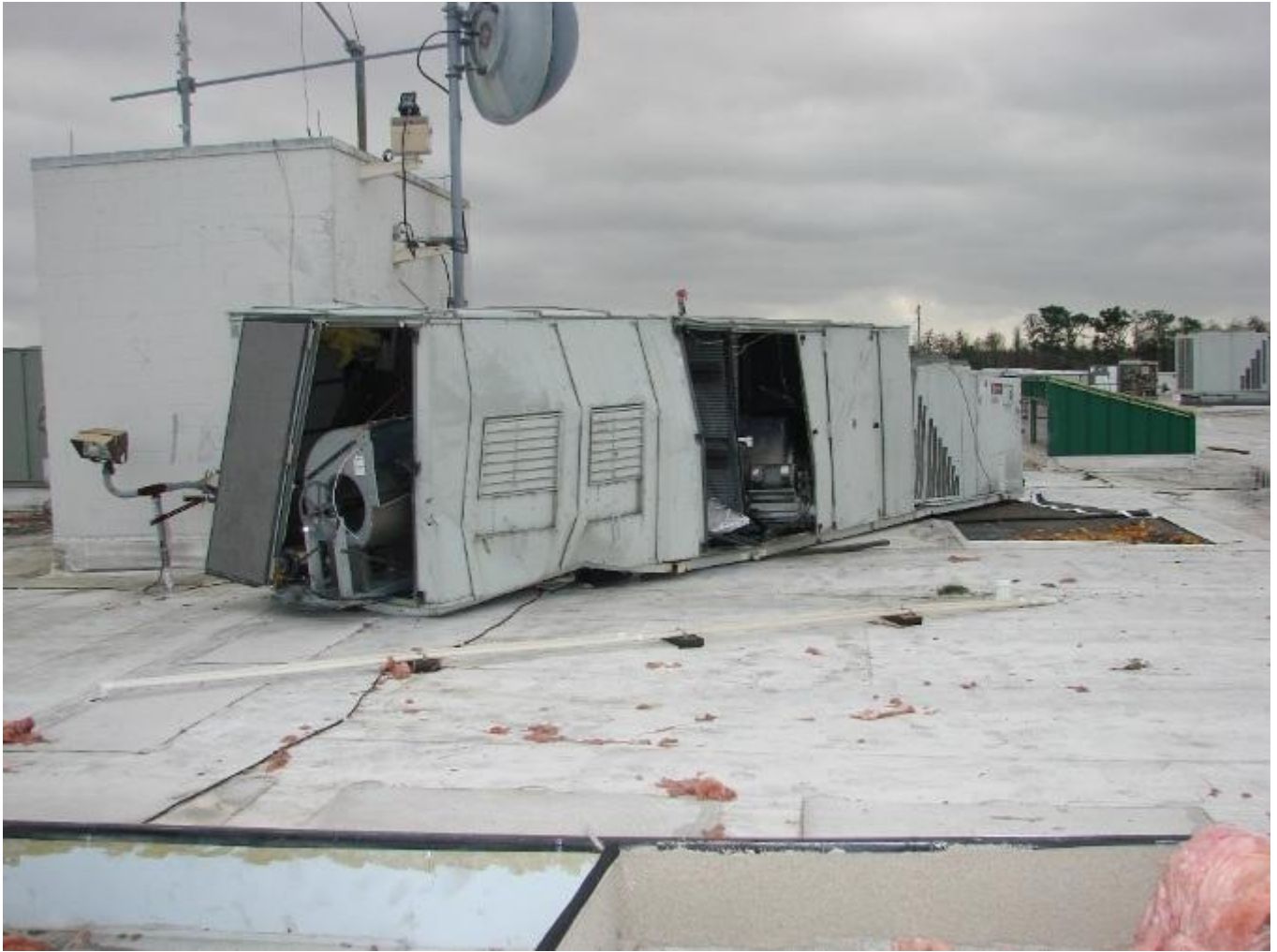
Figure 5. Site C damage (Jailhouse air conditioning roof units).