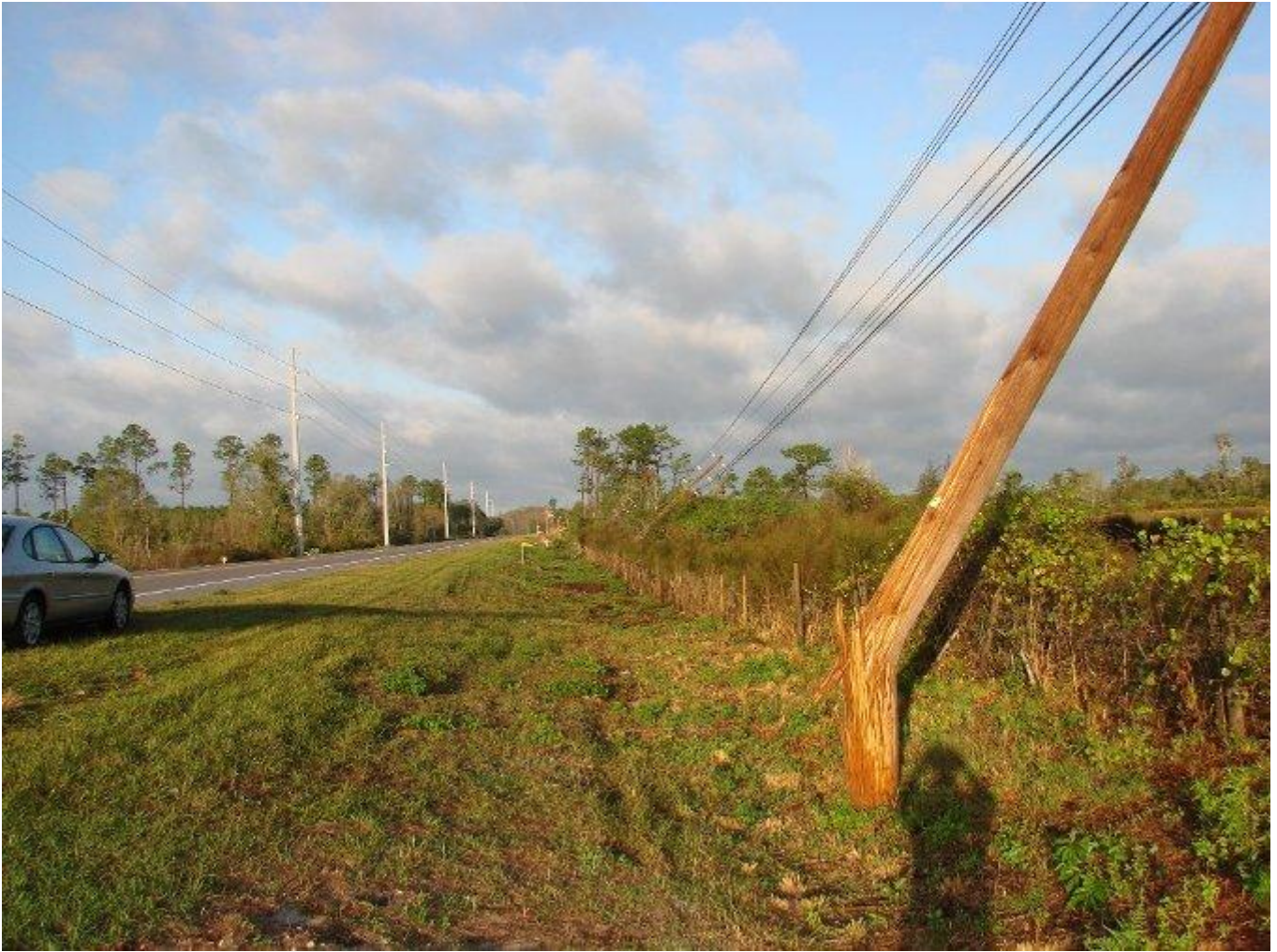
Figure 7. Site D damage (State Road 52).