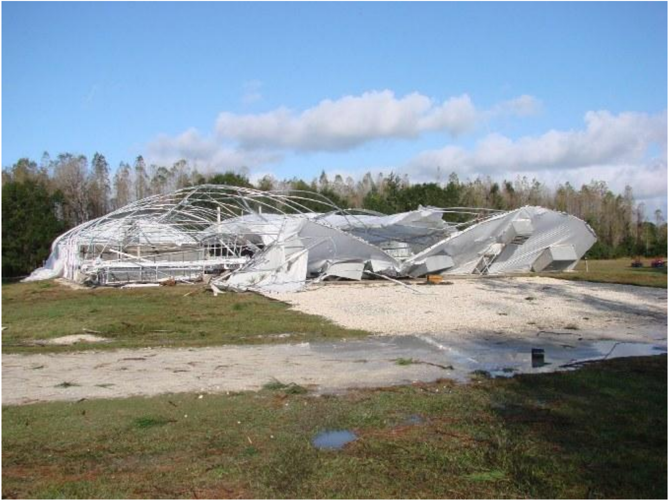
Figure 4. Site B damage (Gardening & farm facilities).