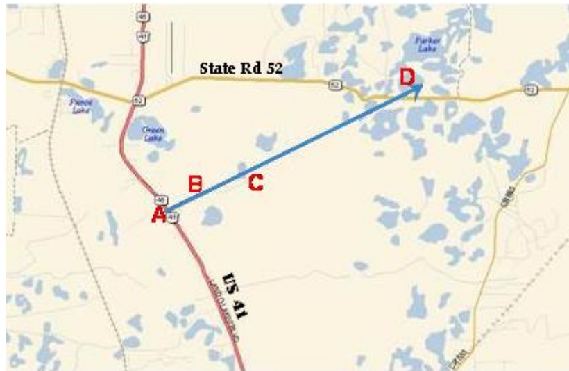
Figure 2. General map showing impacted area and estimated tornado path.