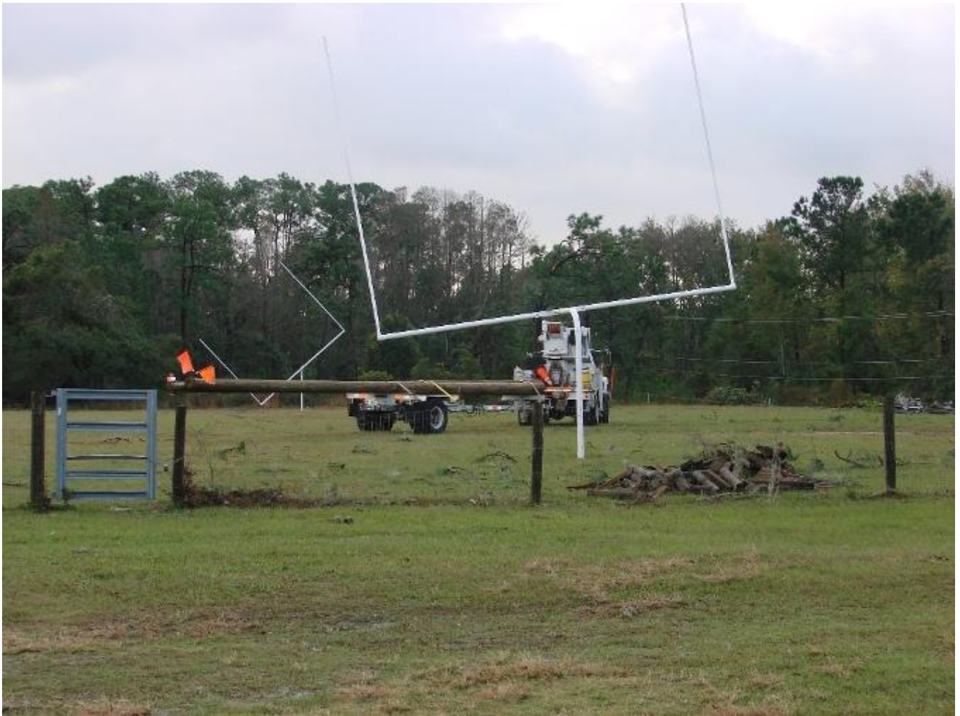
Figure 3. Site A damage (beginning of Central Blvd Rd and Fire House Station).