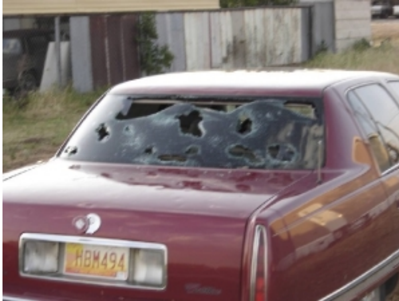
Hail up to the size of tennis balls pelted the downtown area of Hobbs during the afternoon of the 10th. The hail, which was at times wind driven, resulted in more than $400,000 dollars worth of damage.

Storm spotters reported that sporadic tennis ball size hailstones accompanied smaller hailstones in downtown Hobbs. Extensive damage occurred as windows were shattered in vehicles, homes, and businesses. No injuries were reported.