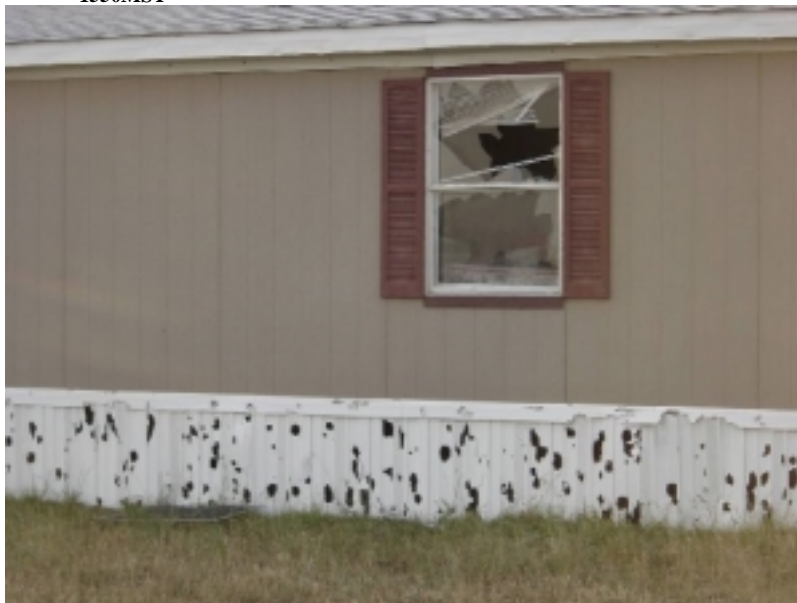
Severe thunderstorm winds combined with large hail to produce significant damage to vehicles, mobile homes, and other lightweight structures just north of Hobbs.

10 1544MST 1550MST 0 0 100K 0 Thunderstorm Wind (EG52)