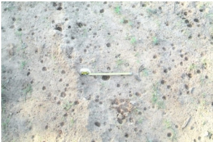
Craters up to two inches in diameter were left in the ground south of Carlsbad from large hail up to the size of hen eggs.

Hen egg size hailstones mixed with smaller hail just south of downtown Carlsbad. Storm spotters and local officials reported damage to area vehicles and homes.