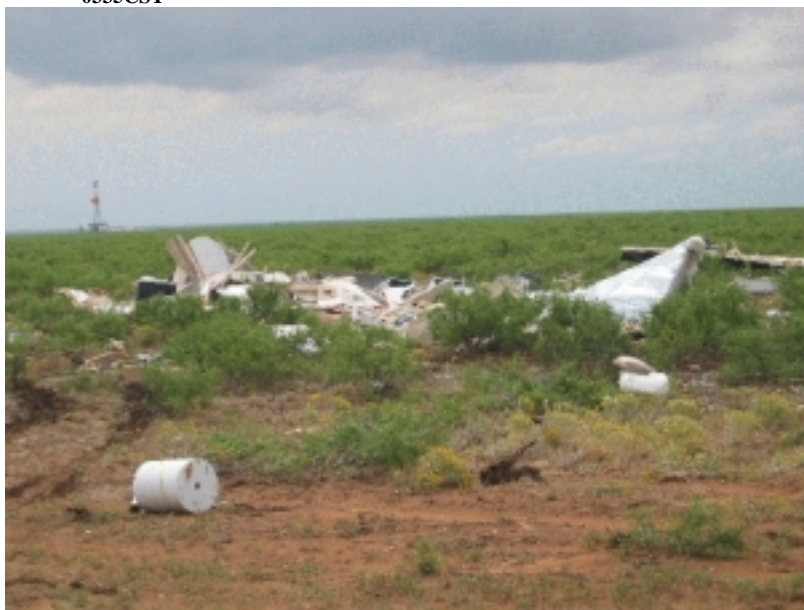
The above image shows one of three trailer homes that were destroyed at remote oil fields in eastern Loving County as destructive winds swept over the county during the early morning hours of the 26th. Three oil field employees were injured.

Destructive winds estimated to be 80 mph affected portions of Loving County. Twenty-six power poles were blown down along a five mile stretch of Highway 302 west of the Loving and Winkler County line. This resulted in widespread power outages. Three oil