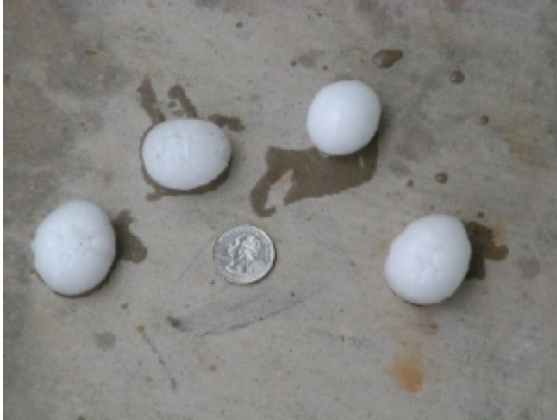
Large hail ranging in size from golfballs to tennis balls caused significant damage in and just south of Carlsbad during the early evening of the 6th.

06 1709MST 1714MST 0 0 700K 0 Hail(1.75)