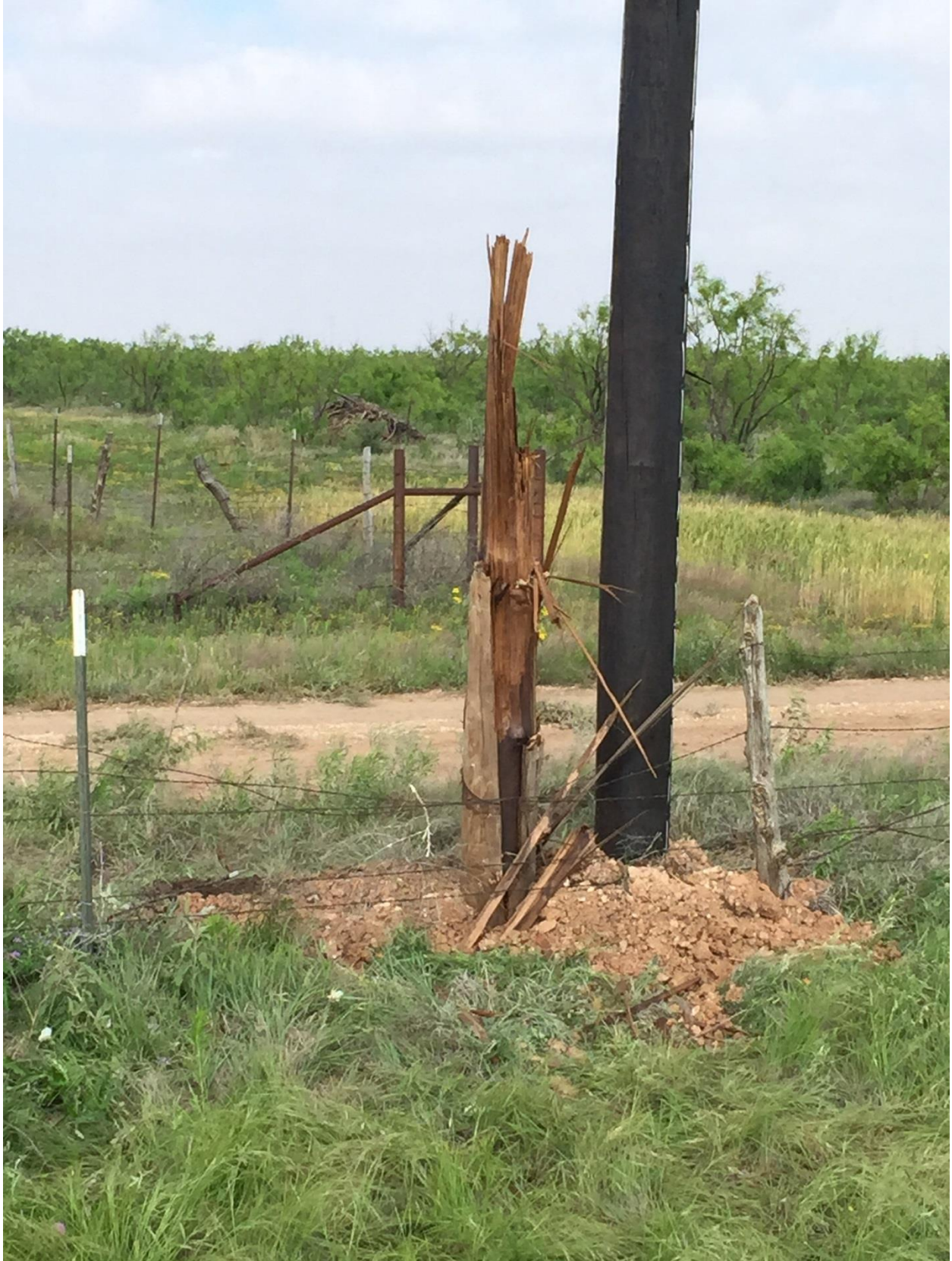
Figure 3: Snapped Power Pole.