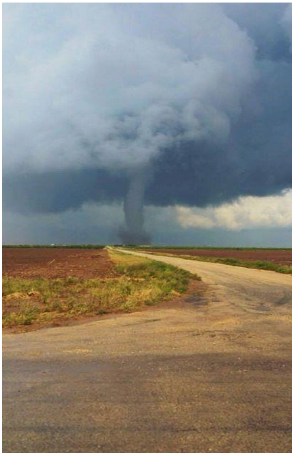
Figure 1: Vealmoor tornado