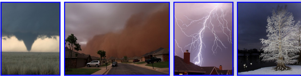
The South Plains is known for its brief but intense bouts of active weather, but in reality, the west Texas climate is dominantly mild and pleasant.

Of course, you are considering a job at NWS Lubbock because you desire to sharpen your professional skills while witnessing dramatic weather from the confines of a high-tech operational environment... right? The South Plains is known for its active spring severe weather season. Each year, portions of the NWS Lubbock forecast area receive damaging thunderstorm winds, large hail, incredible lightning displays, and an average of 18 tornadoes. However, forecasting in west Texas will provide you with a well-rounded experience. While the climate is typically fair and arid, the region is also prone to a variety of weather hazards that range from wind and dust storms, to occasional winter storms and wind-driven grass fires.