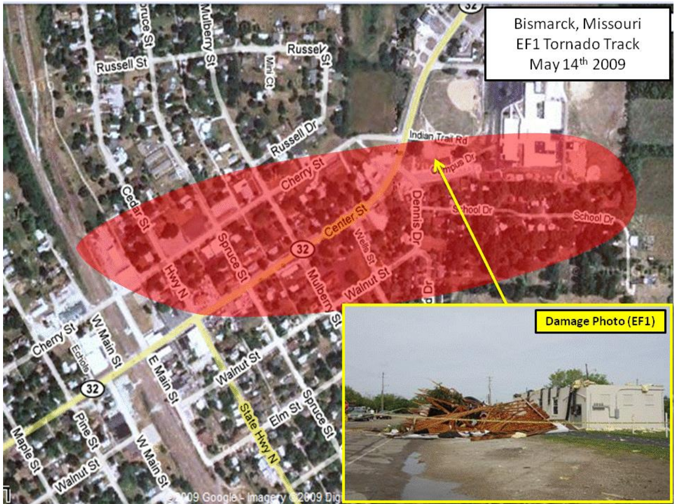
EF1 Tornado Track and Damage in Bismarck, Missouri

Most of the damage in Bismarck, Missouri was caused by one small tornado. The survey of damage indicated a brief tornado touched down near Highway BB and Cherry Street, then moved eastward to the northeast edge of town along School Drive. Most of the damage was to trees, with minor roof damage also common. More substantial damage was done to a preschool building along Campus Drive, with the gabled roof torn completely from the well constructed masonry building and thrown into the adjacent parking lot. Damage patterns showed reliable indications of rotation. The path length was approximately 1 mile long and 200 yards wide. The severity of roof damage to the preschool building warrants an intensity ranking of EF1 on the Enhanced Fujita Scale.