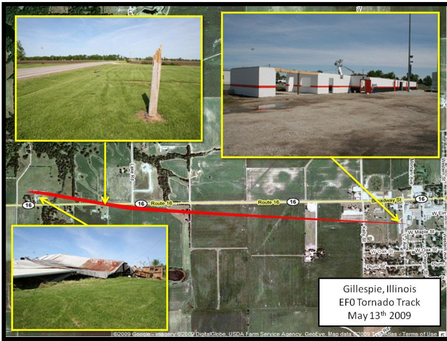
EFO Tornado Track West of Gillespie, Illinois

The damage west of and in the city limits of Gillespie, Illinois was caused by downburst winds and one small tornado. The survey of the damage indicated an intermittent tornado track from 1.5 miles west of Gillespie to the west side of Gillespie at the High School. Several homes and outbuildings were damaged along with a power pole. The tornado was 20 to 30 yards wide and traveled adjacent to Illinois Route 16 toward Gillespie. A building on the high school campus lost its roof and the damage was rated EFO on the Enhanced Fujita Scale. Directly south of the tornado track downburst winds caused widespread damage, that continued through the center of Gillespie. Numerous buildings had damage and many trees were blown over or snapped off. Wind speed was estimated to have been between 60 and 80 mph within the downburst swath.