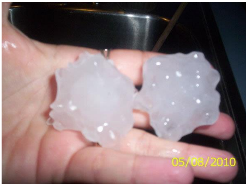
Cuba, Missouri Severe Hail