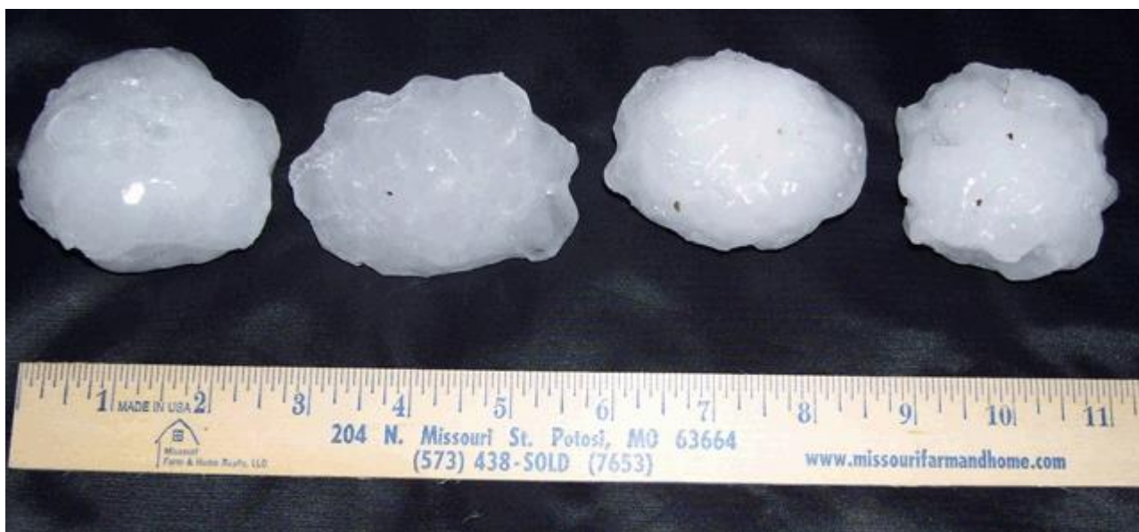
Baseball-sized hail From Potosi, Missouri