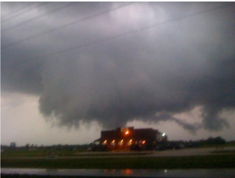
Wall cloud and Funnel Cloud near Hawk Point in Lincoln County, Missouri