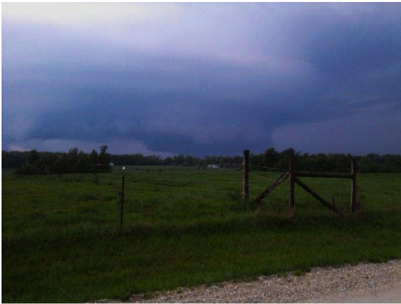
Wall cloud visible northwest of Warrenton in Warren County, Missouri