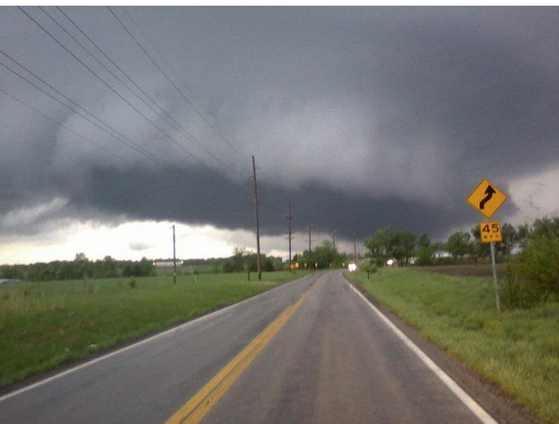
Wall cloud visible west of Troy in Lincoln County, Missouri