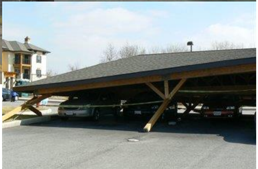
Carport collapses in St. Peters, near Woodlands Park, damaging ten cars.