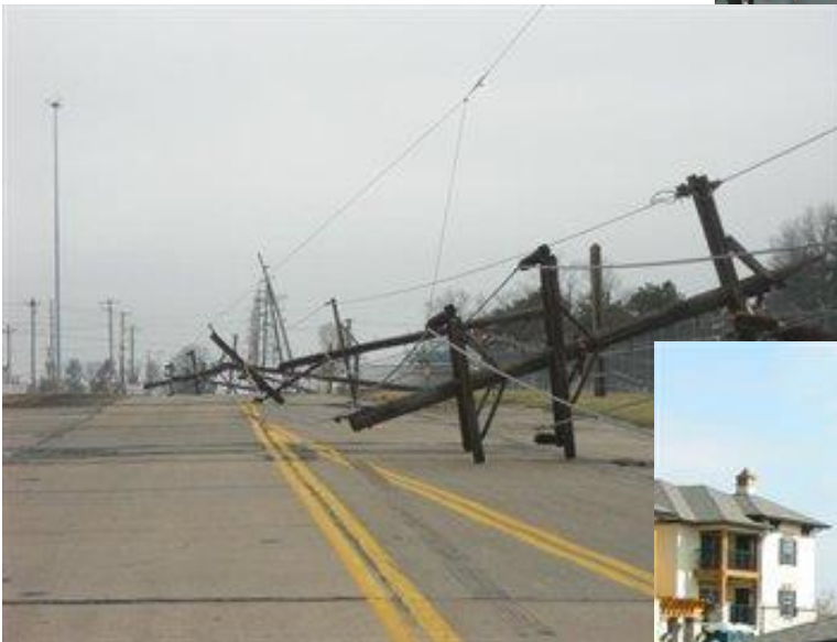
Power line damage in Hazelwood along Fee Fee Road south of McDonnell Douglas Blvd.