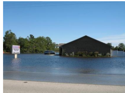
A church along Highway 171 is engulfed by flood waters