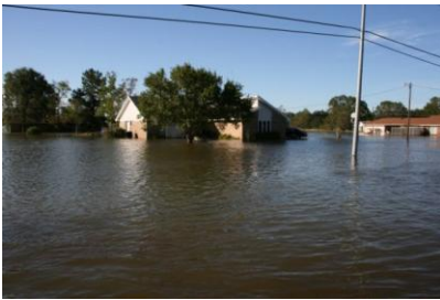
Flooding engulfs this house on Joe Miller Road