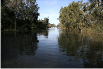
Joe Miller Road in Moss Bluff, LA is completely submerged