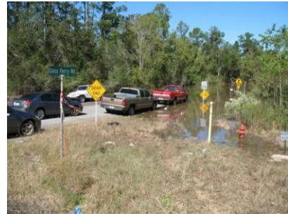
The entrance to Goos Ferry Road in Lake Charles is blocked by flooding