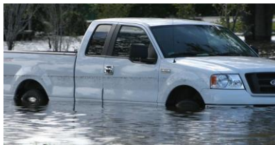
A truck in Topsy shows how high the flood waters rose