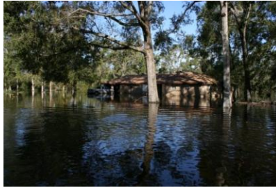
A house on Joe Miller Road is inundated by flood waters