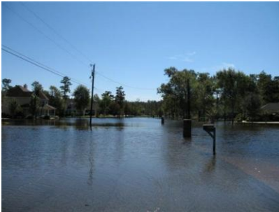
West Armand street in Moss Bluff, LA is completely submerged