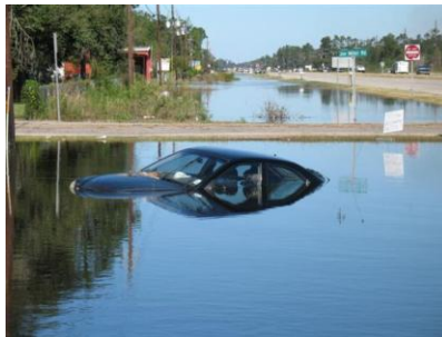
A car is submerged at Joe Miller Road and Highway 171