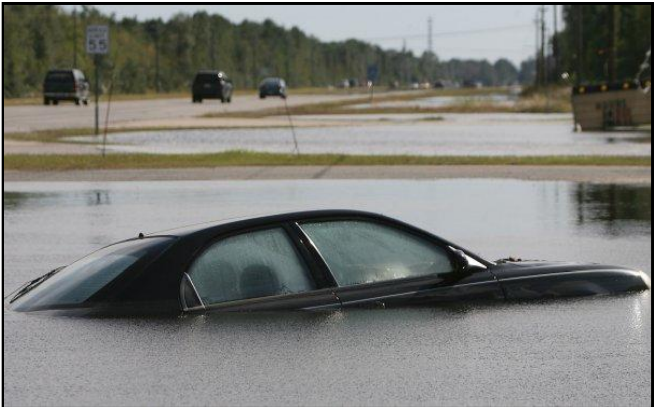
A car is submerged by flood waters along U.S. 171 in Moss Bluff, LA on October 28, 2006