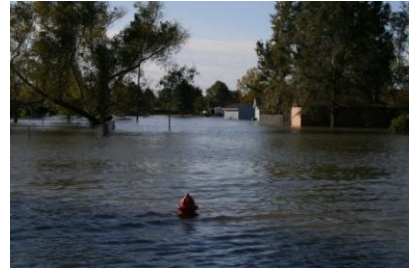
An entire neighborhood in Moss Bluff is flooded