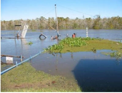
An industrial dock along the Calcasieu River at Old Town Bay is almost completely submerged