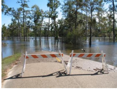
Areas of Sam Houston Jones State Park near the Calcasieu River are underwater