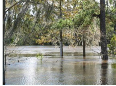
River gage at Sam Houston Jones State Park showing the flooded river at a level over 9 feet high on 10/27