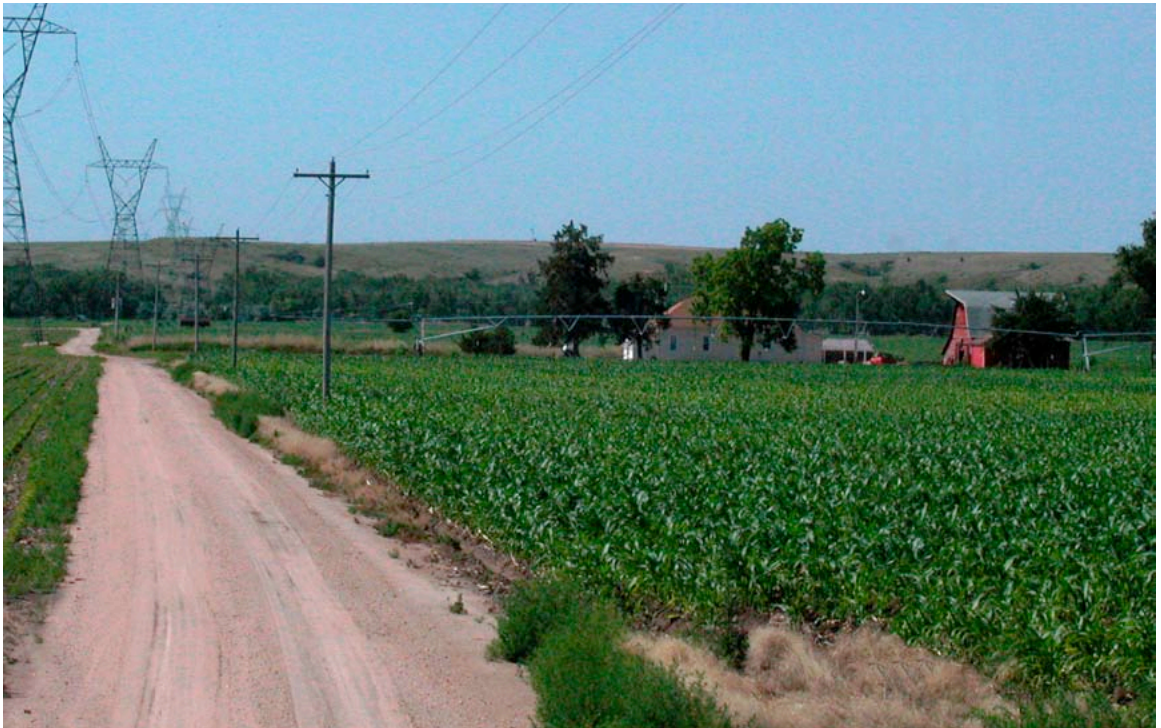
The Cappel farmstead as it is yet today. The house and barn and chicken house stand. New tenants have planted seedings and crops grow in the fertile Republican River valley. The photo was taken looking south to the river from the Burlington Railroad crossing in the spring of 2004.

We could see different colors of clothes show up on the roof of the dairy barn and