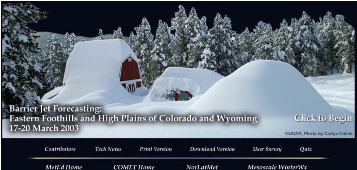
Figure 2. COMET learning module for Barrier Jet Forecasting. One of the prerequisite readings for students in the Mountain Weather Course.