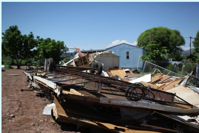
Trailer destroyed by high winds.

During the afternoon of July 19 a severe thunderstorm hits Gila New Mexico, producing extreme damaging wind gusts along with small hail and heavy rains. The greatest damage was along a one mile-long swath where wind speeds reached almost 90 mph.