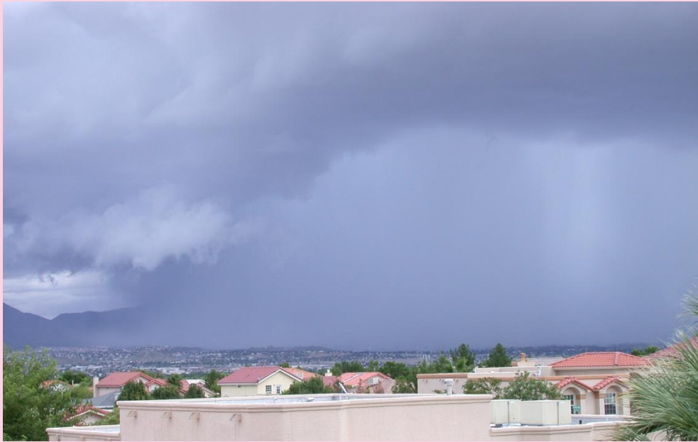
Thunderstorms with heavy rains move over west El Paso on July 31.

July 22: Two inches of rain fall near Radium Springs in Dona Ana County causing rural flooding.