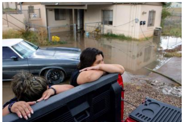
September 22-23 heavy rains flood portions of east El Paso.