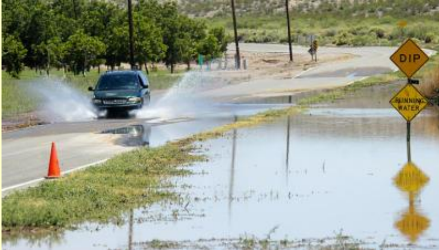
Heavy rains cause flooding in the Hatch-Rincon NM area on July 11.

May 2: Windy with gusts around 50 mph across the region.