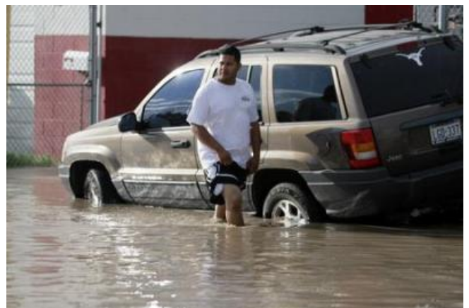
West El Paso after July 24 heavy rains.

July 11: A deep southerly flow transports abundant moisture into the area while an upper level disturbance enters from the west. This weather pattern generates showers and thunderstorms with torrential rains from late morning through the evening. Over 4 inches of rain fall near Anthony TX with 2 to 3 inches around Santa Teresa and west El Paso. High water floods West Canal Road Bridge in Hatch. In the Radium Springs and Rincon area floodwaters push cars off the road near Highway 187 and Santiago Peak Road.