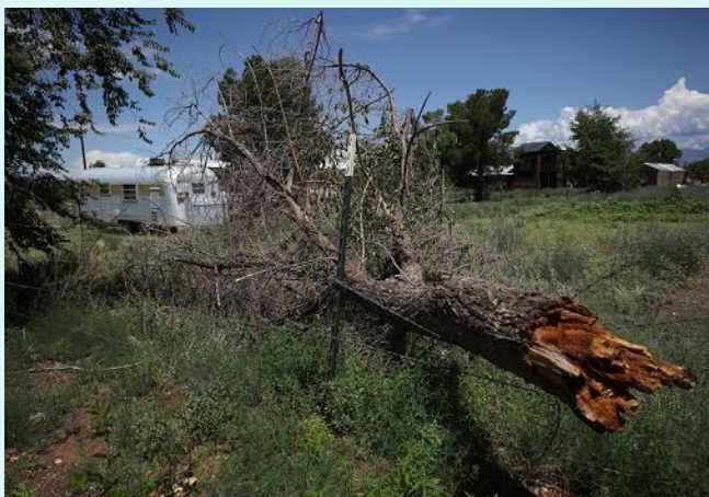
Pine tree blown down.