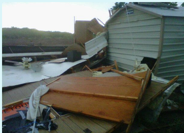
Gila NM property damage. (Loretta Brown)

A large pole barn was destroyed and damage occurred to other buildings and property in the vicinity. In addition the winds uprooted a pine tree and flattened vegetation.