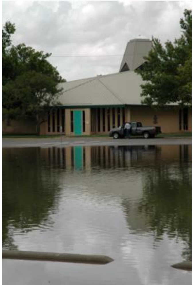
During the evening and early morning hours of July 25-26 torrential rains flood portions of Las Cruces. ( Diana Alba Las Cruces Sun News)

July 21: Severe thunderstorms with heavy rains move across Luna and Grant Counties. Wind gusts of 60 mph damage a hangar at Columbus Airport while rains flood portions of Highway 11. In addition almost 2 inches of rain flood rural areas near Deming. In Grant County a drainage ditch overflows and floods a street in Hurley and about 2 inches of rain are measured at Buckhorn.