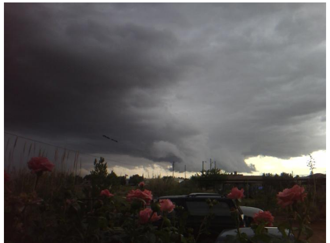
On August 24 thunderstorms drop heavy rains across Dona Ana County.

August 15: Nickel-size hail and minor wind damage occur near Animas NM when evening severe thunderstorms move across Hidalgo County.