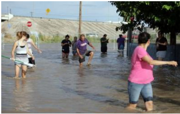
Thunderstorms with heavy rains flood portions of west El Paso on July 24.

June 24: Severe thunderstorms produce wind gusts to 60 mph over El Paso while dime-size hail falls at Lake Roberts NM.