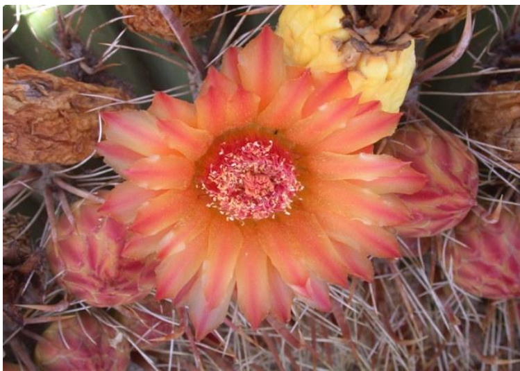
Cactus flowers in bloom at Santa Teresa.