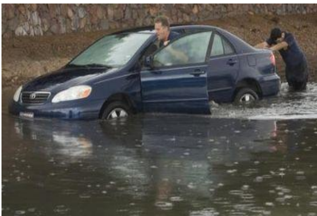
Flooding over El Paso after the heavy rains of September 13.

September 22-23: Portions of east El Paso flood as up to 2 inches of rain fall. A woman is rescued after floodwaters sweep her car from the road.