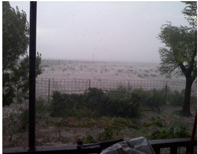
Large hail falls over Animas NM on August 15.

August 13: Severe thunderstorms strike the Fabens TX area. High winds blow down 4 light poles with hail also reported.