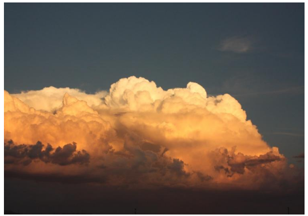
This thunderstorm produces large hail over El Paso on September 15.

August 30 : Thunderstorms drop almost an inch of rain over Las Cruces.