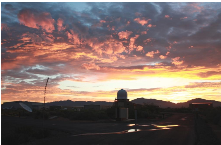
Sunrise over Santa Teresa.