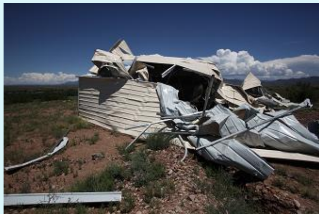
Winds also destroy a pole barn. (Mike Hardiman )

overturned and destroyed a new trailer while another mobile home suffered significant damage when the roof was blown off.