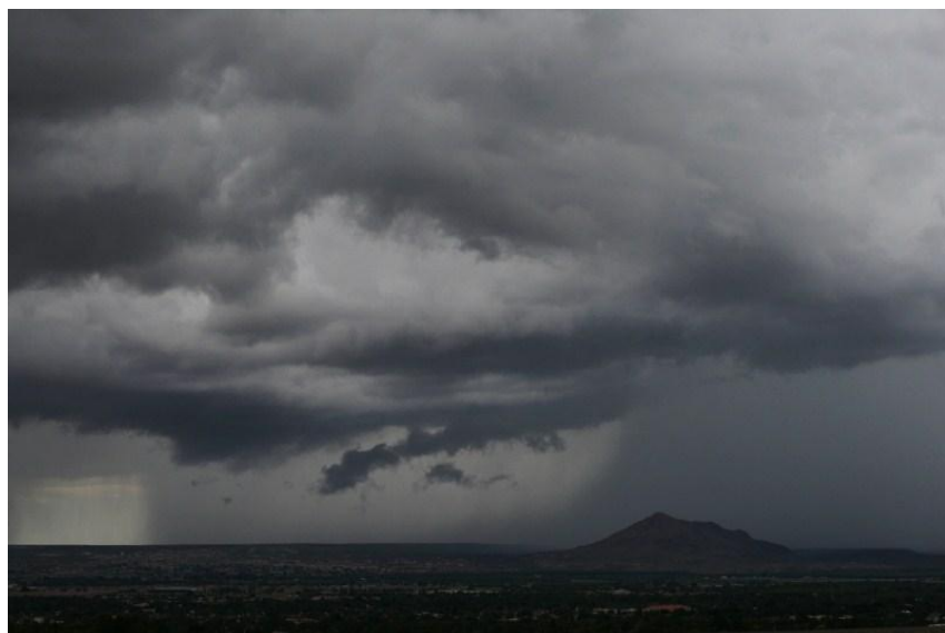
Thunderstorms with heavy rains in the Las Cruces area on July 25. (Jeff Passner)