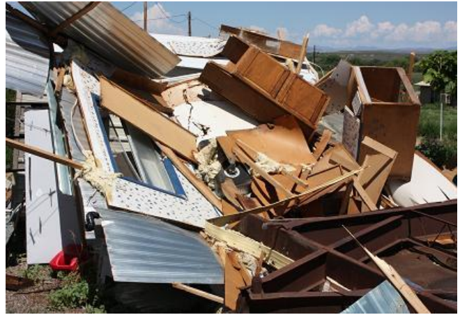
Thunderstorm winds cause severe damage around Gila NM on July 19.

in mostly dry weather over the El Paso area in August, it remained rather wet and stormy across southern New Mexico. Then in mid September an upper level low pressure system produced much needed heavy rains around El Paso. In late September high pressure aloft ended the 2010 monsoon with early autumn warm and dry weather through almost all locations.