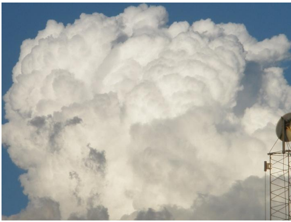
Severe thunderstorm developing over El Paso on September 15.

August 18: 1.5 inches of rain fall in an hour at Radium Springs.