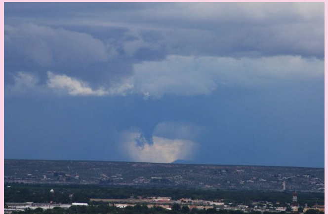
Thunderstorm with heavy rains fall around Las Cruces on July 31. (Jeff Passner)

July 25-26: Evening and early morning showers and thunderstorms dump torrential rains across the Las Cruces area. New Mexico State University records a record 3.36 inches of water with numerous buildings, homes and streets flooded around Las Cruces, Mesilla and Dona Ana. Floodwaters