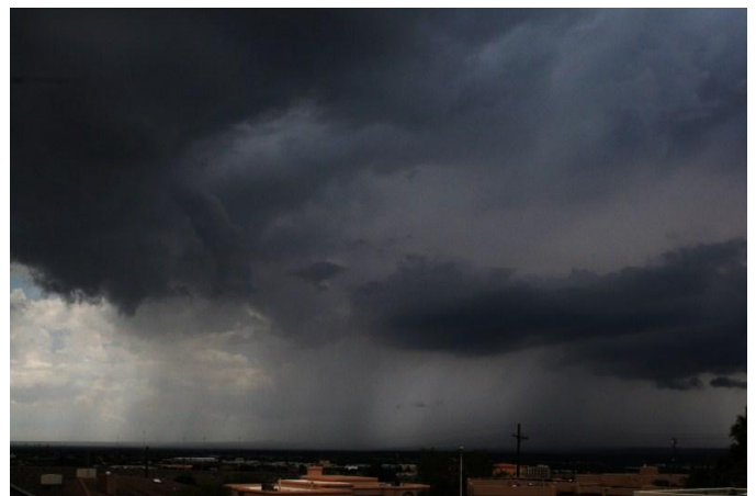
Strong thunderstorms with heavy rains near Las Cruces on July 24. (Jeff Passner)