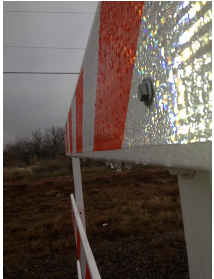
Above: Light coating of glaze from misty freezing drizzle across northern Jim Hogg County near Hebronville, February 6, 2014.