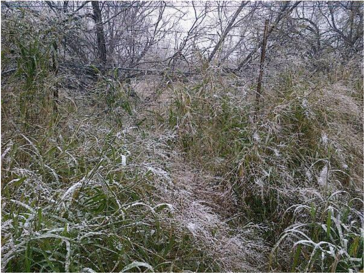
Light Snow coating brush and trees in Zapata, Texas (via Facebook through Nancy Cowling Umphres).