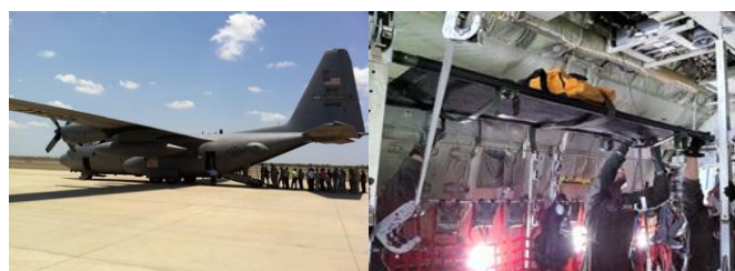
Left: C130 transport used for medical needs evacuation at McAllen/Miller International Airport. Right: Inside the C-130, showing an example of a “bunk” where patients would lie during transport. At least 35 patients can be transported securely in each specially outfitted C-130.

Hurricane “Barry”, designed by WCM Goldsmith and based on major Hurricane Allen (1980), showed how clearly communicated weather information is used to make large scale and often expensive decisions to ensure public safety for a growing population with abundant functional and medical needs.