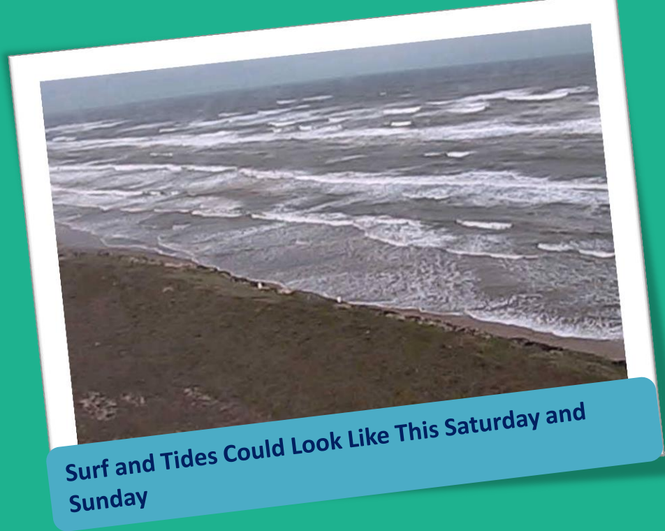
Surf and Tides Could Look Like This Saturday and Sunday