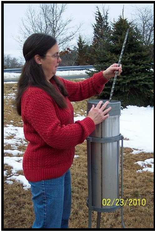
Pictured left is an observer measuring rainfall from the SRG.