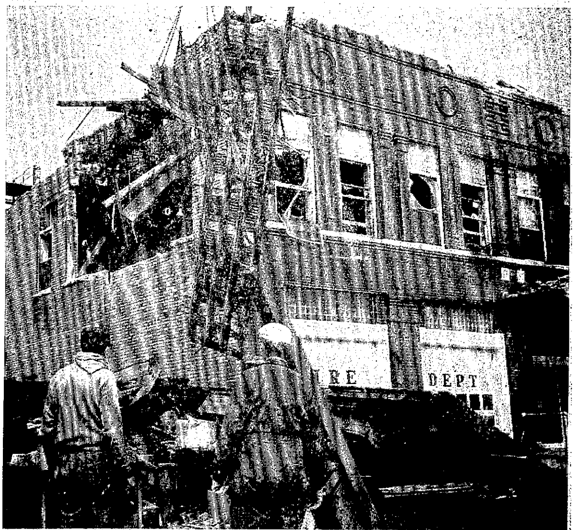
OELWEIN'S CITY HALL. The City Hall of Oelwein suffered extensive damage. City officials moved back into the first floor offices Monday according to Clerk Tom Peterson. Also listed as a total loss was the Cross Printerie building adjacent to the city hall.