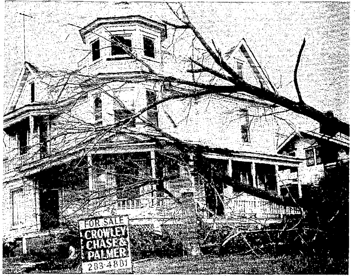
WOULD YOU BE INTERESTED?