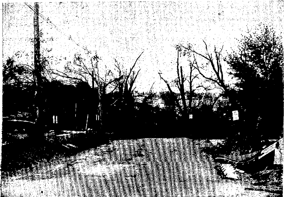
STREETS THROUGHOUT the city were virtually closed Wednesday afternoon at 5 p.m. after the twister passed through the city and proceeded on to Maynard and Charles City. Thursday at about noon most streets were passable, due to the help of thousands of persons (some we'll never know) from all over the state.