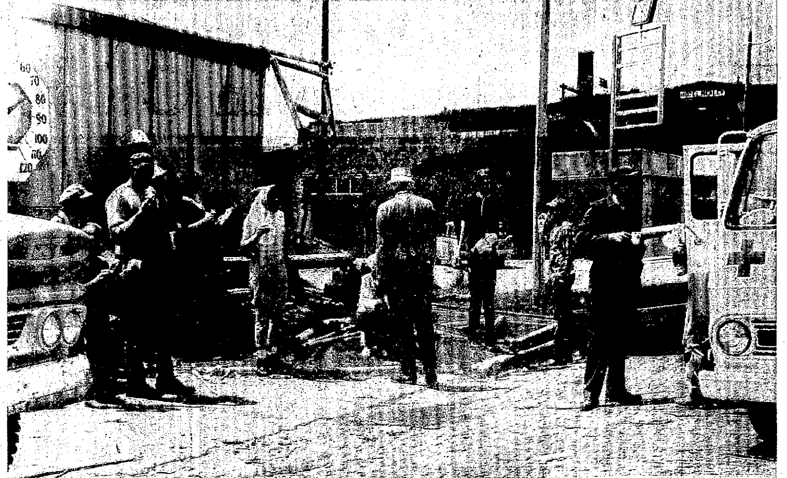
RED CROSS UNITS moved into both Oelwein and Maynard the night the tornado struck and worked with district members without stopping around the clock. Main headquarters was set up in the basement of the Presbyterian church, with a second large unit working out of Sacred Heart on South Frederick.