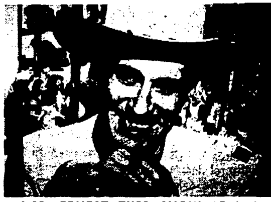
6:00-ERNEST TUBB SHOW (Color) The pick of the Country-Western hits by singer-composer Ernest Tubb and His Texas Traubadours

1125 FIRST AVENUE SE Open 4 p.m. to 12:30 a.m. Daily Friday and Saturday 'til 2:30 a.m. PHONE 365-9453