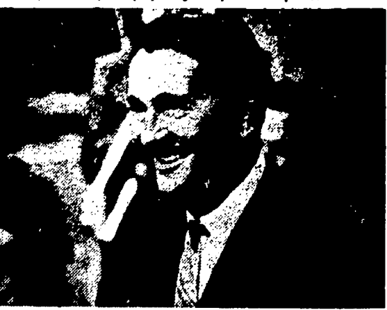
7:30—LAWRENCE WELK SHOW (Color) Maestro Welk and The Champagne Music Makers in a rousing salute to Armed Forces Day!

7:00-THE NEWLYWED GAME (Color) Psychology, insuition, ESP, or just plain luckthey all may help young couples win prizes!