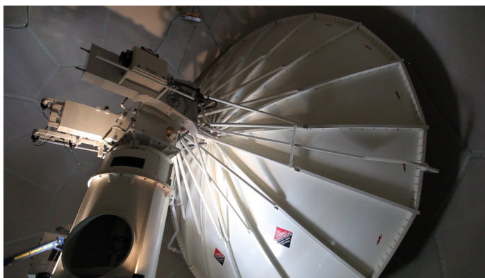
The radar receiving dish inside the protective cover. Dual-pol is both a hardware and software upgrade to the radar.

The dual-pol upgrades — completed in late April at every NWS-operated Doppler radar in the U.S., represent a NOAA-wide accomplishment. NOAA developed the technology through decades of research at the Oceanic and Atmospheric Research's National Severe Storms Laboratory , while NWS and contractors designed, tested and installed the upgraded systems and organized timely and relevant training so that forecasters could effectively use the data and technicians could maintain the radars.